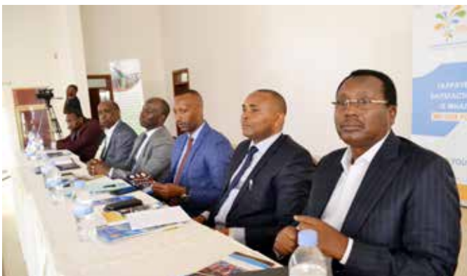
Delegates RWAFFA's 3rd EACFFPC Graduation