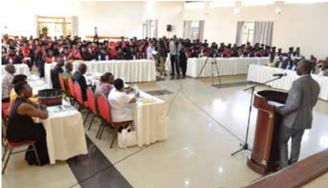
RWAFFA's 3rd EACFFPC Graduation Ceremony on 22nd Sept 2017