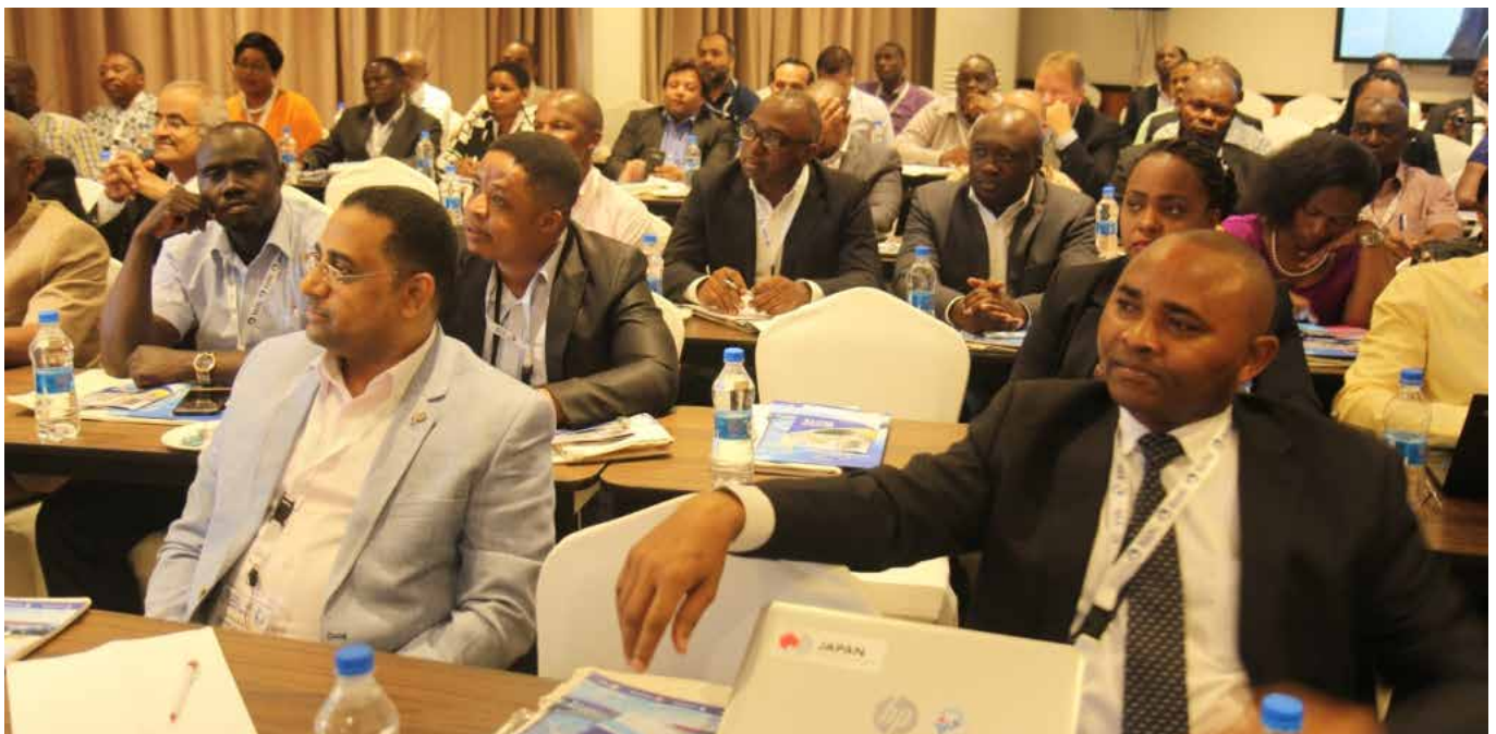
Global Logistics Summit in Dar Tanzania 2017

FEAFFA will continue engaging the national associations on domestication of the regional model bill on self-regulation through development of national laws. Greater emphasis will be on Rwanda which is piloting to have its law fast tracked. This will provide a good learning point for the rest of the region. Advocacy especially where some key individuals have since been replaced will continue in