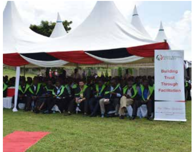
The 14th EACFFPC Graduation in Mombasa

EACFFPC Training continued in all countries with classes spilling over from 2016 including in Burundi. Zanzibar started their first ever EACFFPC classes under the stewardship of the Institute of Tax Administration (ITA). The inaugural class was jointly financed by JICA as part of the support to the model bill, FEAFFA, ZFB and TRA - Zanzibar. The training in Zanzibar was preceded by a training of trainers in which 17 trainers were trained