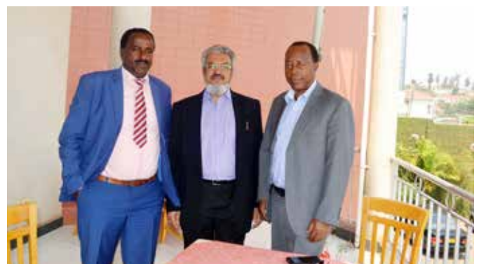
Members during the 2016 AGM Meeting in Kigali Rwanda