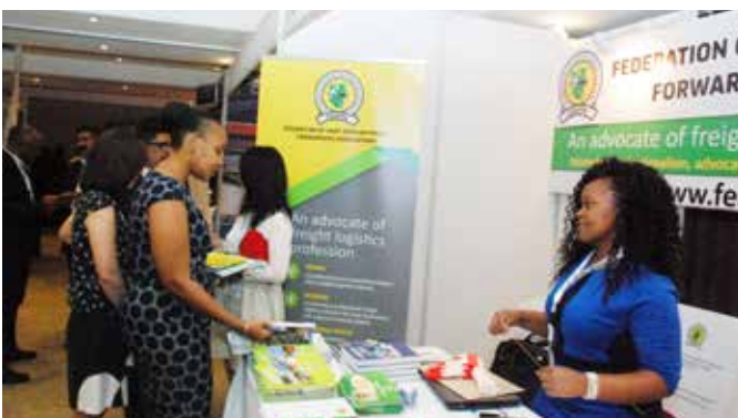
FEAFFA Staff with a guest from TPA during Global Logistics Summit in Dar 2017