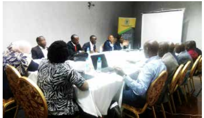
HIV/AIDS and Health Training Materials validation meeting in Kampala