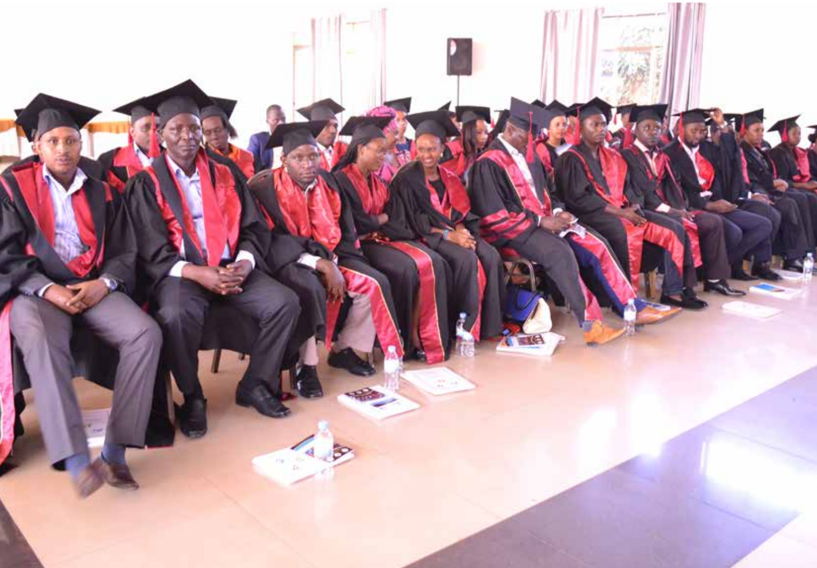
RWAFFA's 3rd Graduation Ceremony on 22nd Sept 2017

FEAFFA supported national associations to sensitize their members on upcoming issues. Most of this was on the revised EAC rules of origin. Developed of a capacity building project on the Authorized Economic Operator (AEO) gained momentum attracting the interest of a possible partner.