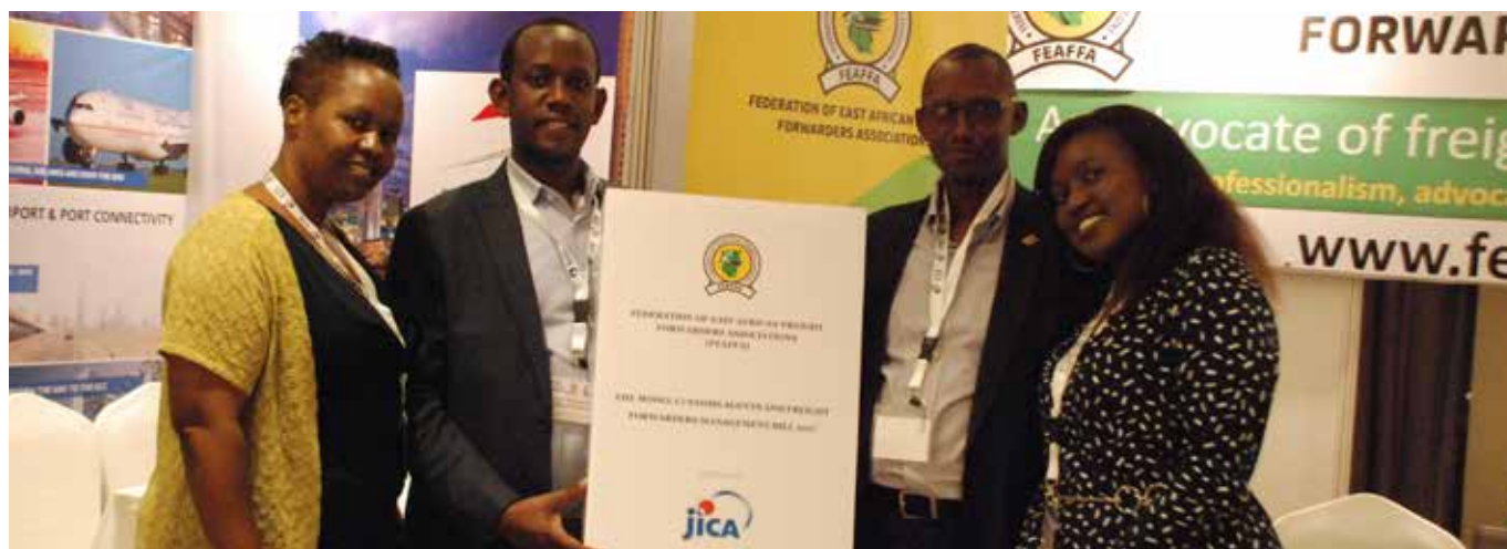
The Launch of the Model Bill in Dar 2017

To address these shortcomings, FEAFFA intends to continue focusing on institutional capacity building and sustainability, investing in training on Corporate Governance and other aspects of institutional development especially for the member associations. It will continue to engage development partners on prospective projects, pursuing domestication of the law on self-regulation especially in the pilot country, fast tracking the review of the FEAFFA strategic plan and putting in place measures to ensure flagship interventions are effectively implemented.