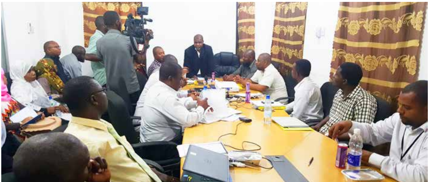
Zanzibar EACFFPC Training of Trainers

The Federation was affected by review of priorities by some of the development partners who were supporting some of the initiatives. This was also partly due to lapsing of some of the programs under which FEAFFA was being supported regardless of how far the individual projects had gone. This left many initiatives incomplete putting further pressure on the Federation to mobilize alternative resources to support the incomplete projects.