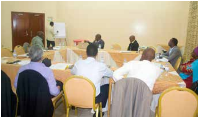
A board meeting in progress in Kigali Rwanda 2017