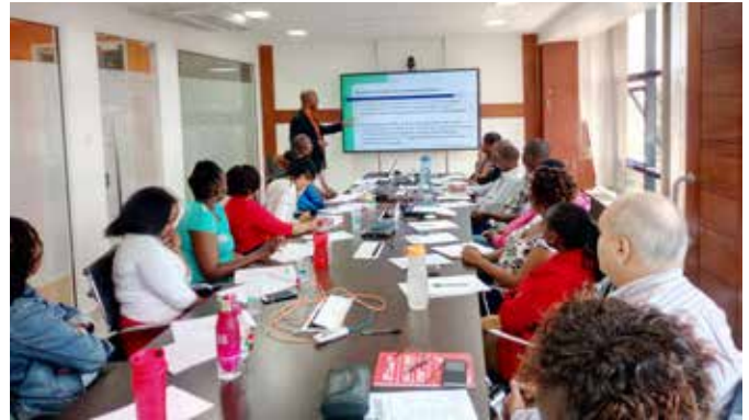
SGS Training on International Trade